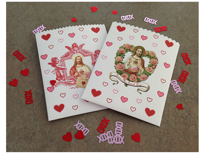
Final Step: This step is optional. Use Pinking Shears or decorative scissors to cut along the top of bag to give it a decorative edge. Once glue dries fill with goodies!