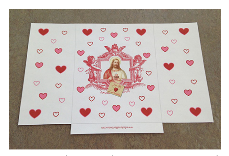
Step #1: With your regular scissors cut your Sacred Heart Valentine Treat Bag out following the outside light grey lines. When finished it should look like the photo above.