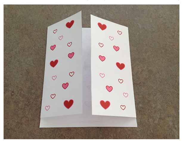
Step #2: Fold down flap located on the left side of treat bag first then continue process on the right side using the light grey lines as your guide as pictured above.