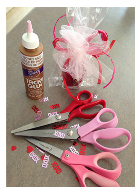
For this project you will need white glue and two kinds of scissors. (Regular Scissors and Pinking Sears or any kind of scissors that will give you a decorative edge)