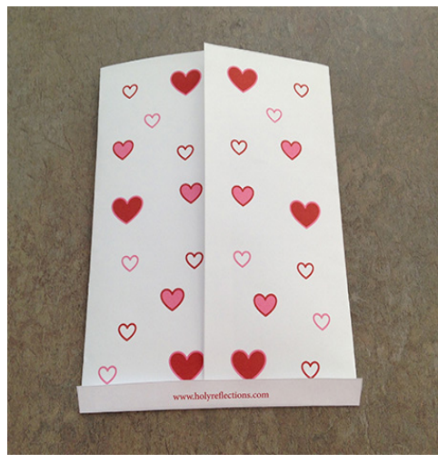
Step #3: Fold down the third flap on the bottom side of treat bag using the light grey lines as your guide as pictured above.